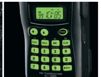
Backlit LCD and keypad