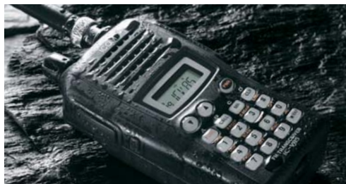
Water resistance, equivalent to IPX4