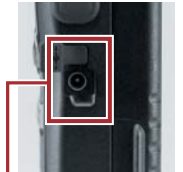
DC power jack

An external DC power jack allows for operation when used with the external DC power supply (11.0V DC). Your IC-V85/E receives and transmits as it charges.